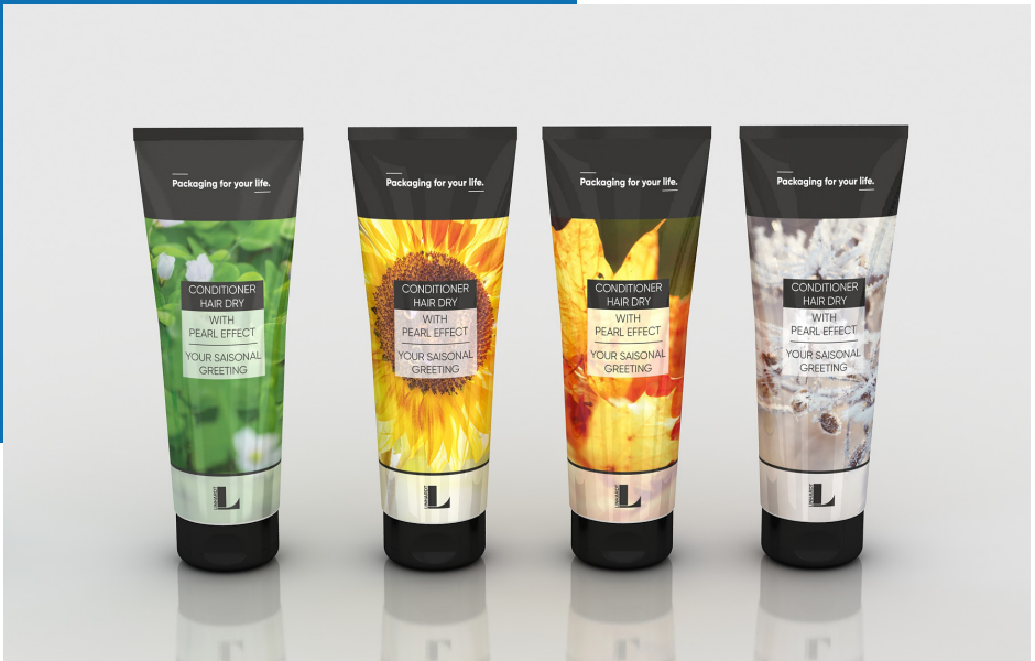
Plastic tubes with HD printing | Kunststofftuben mit HD-Druck